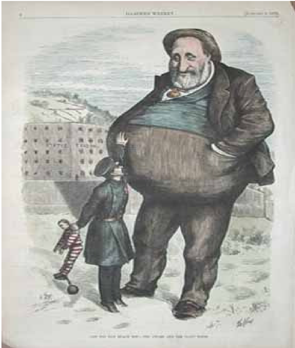
THE GREAT MAN